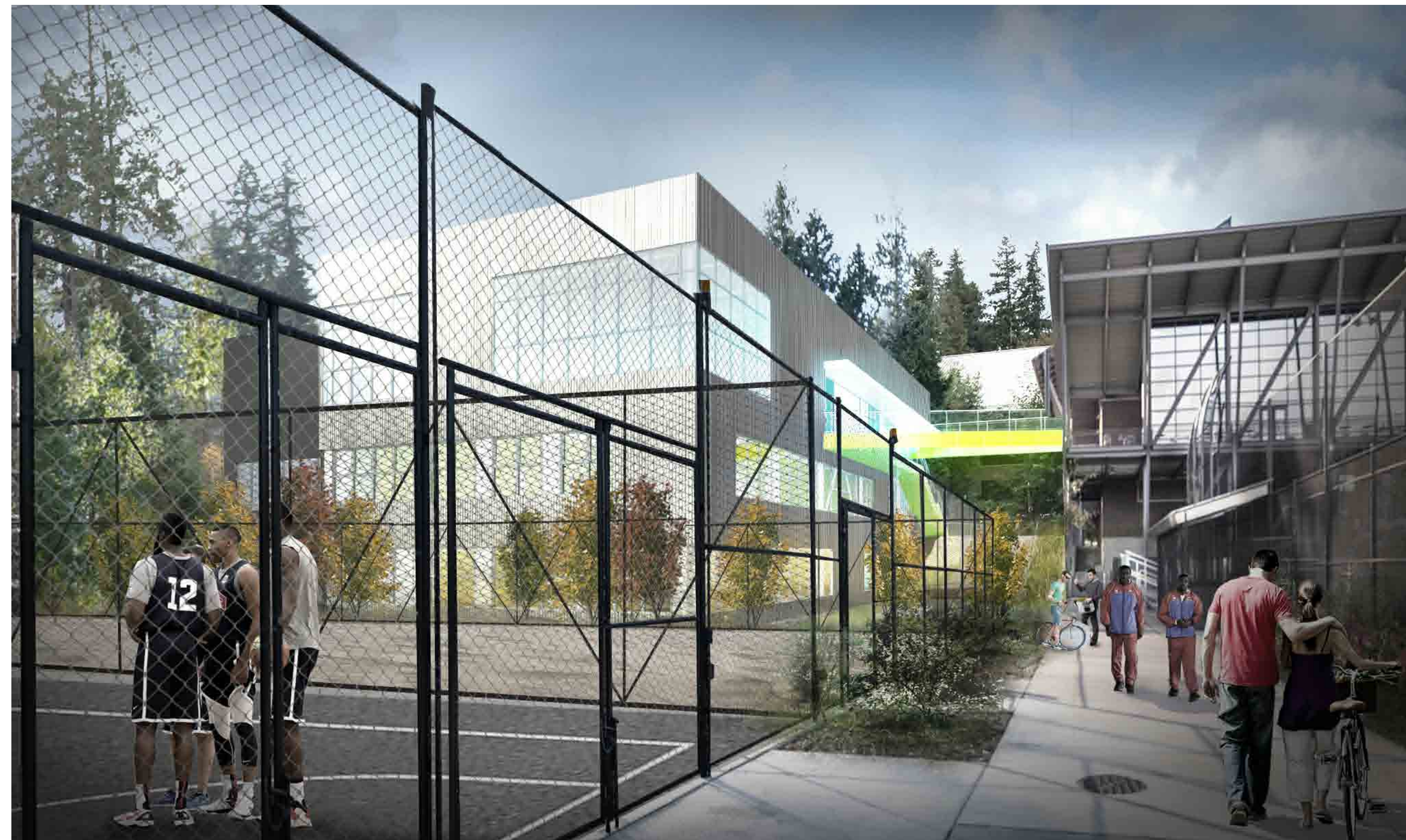
VIEW LOOKING WEST FROM FIELD LEVEL