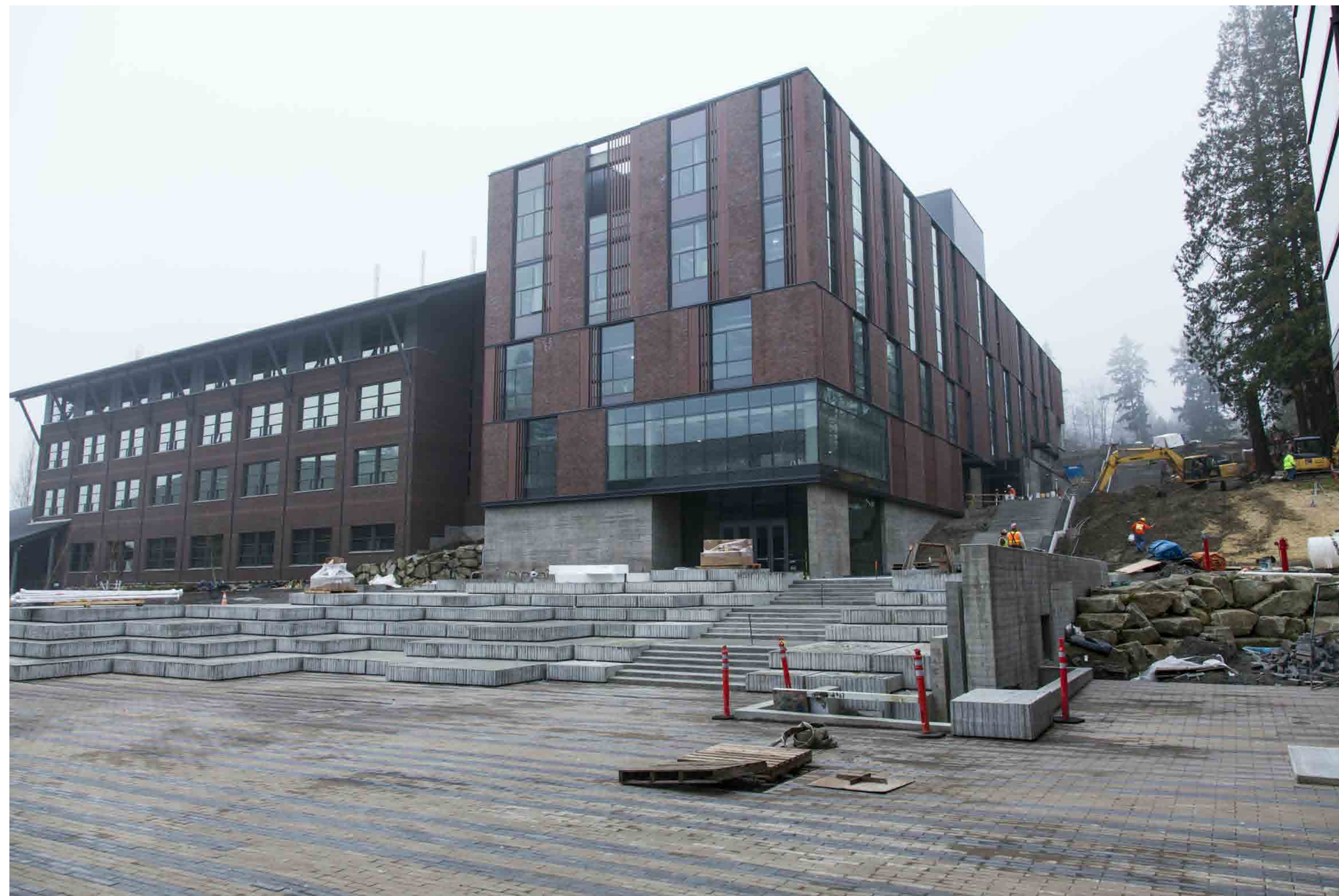
UWB3 (AS VIEWED FROM CENTRAL PEDESTRIAN PATH)