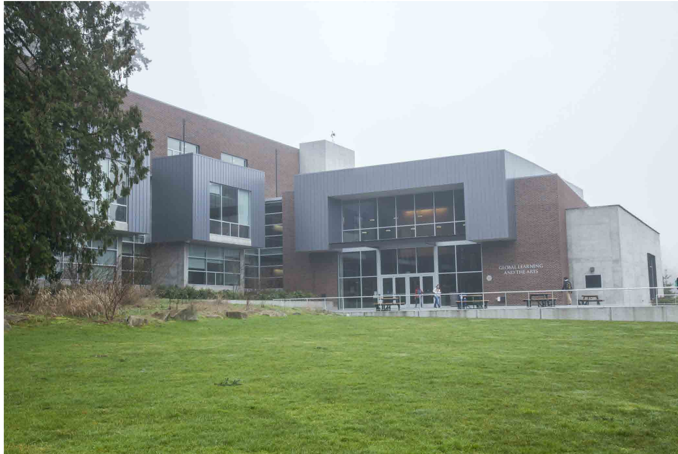
MOBIUS HALL (AS VIEWED FROM CENTRAL PEDESTRIAN PATH)